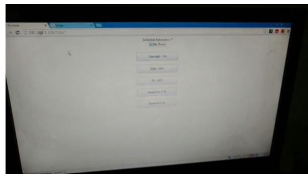
UI for the project