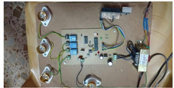
Working model Of the Project

There is Ethernet shield module with its all basic is connected to the port B of Atmega 328 micro – controller. The Arduino Atmega328 creates a HTML page on WLAN network through which it is connected for controlling the loads and Fan speed.